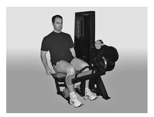
Figure 2 Concentric end range on leg curl machine.

Rated soreness and tenderness were evaluated at baseline and 24, 48 and 72 h post-exercise using a visual analogue scale (VAS). The VAS consists of a 10 cm horizontal line with the two end points labeled 0 (no pain) to 10 (worst soreness ever) (Huskinson, 1974; Joyce et al., 1975). Participants were asked to make a vertical slash across the 10 cm line that corresponded to the level of pain intensity between the limits of no pain felt (left end of line) and worst soreness ever (right end of line). A blank scale was used each time to avoid bias from previous measurements.