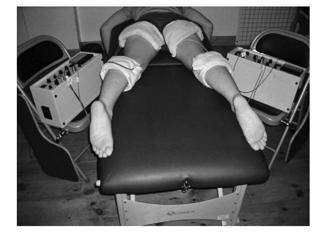
Figure 3 Subject position for FSM treatment.

The VAS has been shown to be a valid and reliable measurement for determining the intensity of human pain, it is minimally intrusive and is easily and quickly administered (Lee and Kieckhefer, 1989; Mattacola et al., 1997).