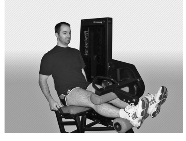
Figure 1 Eccentric end range on leg curl machine.

muscles and positioned so that the patient could not see the front panel of the device or determine which machine was turned on (Figure 3). As DOMS was induced in only the hamstring muscle group, the current was directed only through the soft tissues in this muscle group. The positive leads from the device were attached to graphite gloves that were wrapped in wet towels and placed on the upper portion of the participants' thighs. The negative leads were attached to graphite gloves that were wrapped in wet towels and placed below the participants' knees. This allowed the current to flow between the two leads through the soft tissues of the treated leg. One of the machines was turned off providing the sham treatment and the volume on the working machine was turned down.